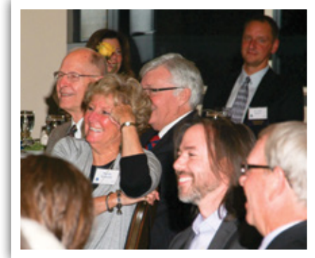
The audience enjoyed an evening of celebration at the 2014 Hall of Fame.